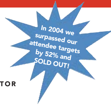
2004 ATTENDEES BY SECTOR